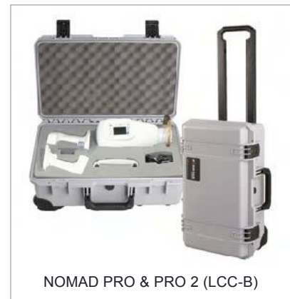
NOMAD PRO & PRO 2 (LCC-B)